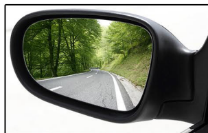
Rear View Mirror