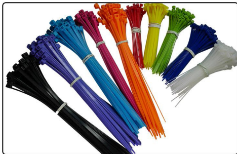
Thin Walled Products